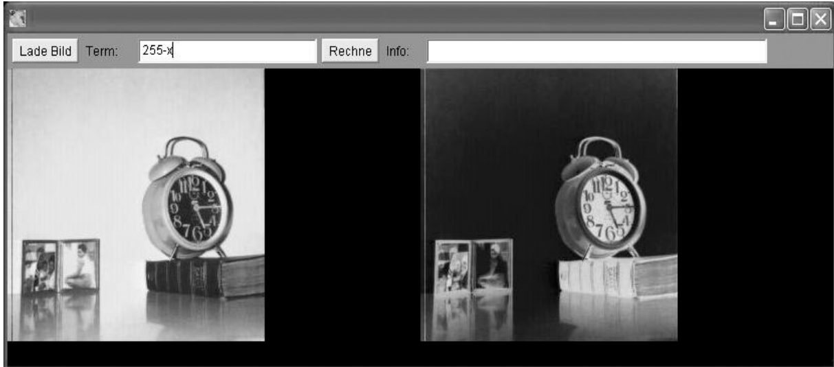
Figure 1. An Applet to transform the brightness of pixels according to a function

age to its negative. This involves only easy algebra. However, usually one has to write programs to do this. To eliminate this difficulty I wrote some Java applets that are accessible on my web page http://myweb.rz.uni-augsburg.de/~oldenbre/webBV/index.html to overcome this problem. Students can perform various operations by specifying the mathematics transformation functions. Examples are shown below in Fig. 1 and 2.